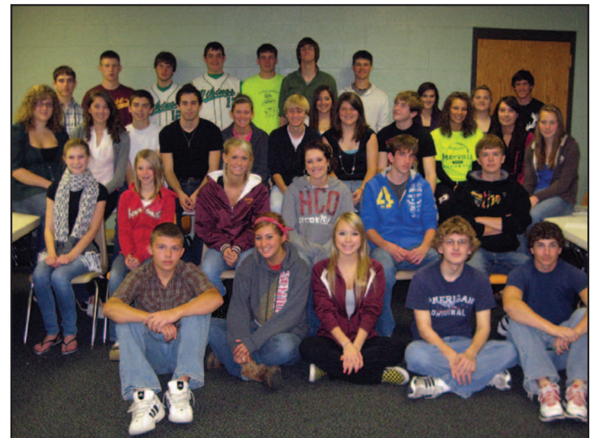
2009-2010 Future Youth Involvement Committee Members

FYI grant allowed the Tuscola Technology Center Drafting Program to purchase an English wheel and metal forming equipment.