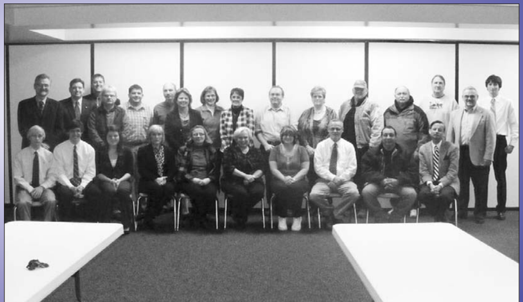
Recipients of the Spring 2011 grant offerings from the Tuscola County Community Foundation are pictured at the Tuscola Technology Center.

When people give to a fund of TCCF, our community benefits. In 2011, 448 people gave the Community Foundation $807,916 in gifts. The gifts ranged from $3 to over $100,000, proving that anyone can be a philanthropist.