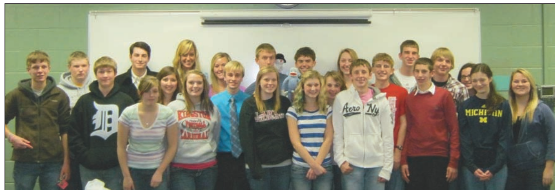
The Tuscola County Future Youth Involvement group.